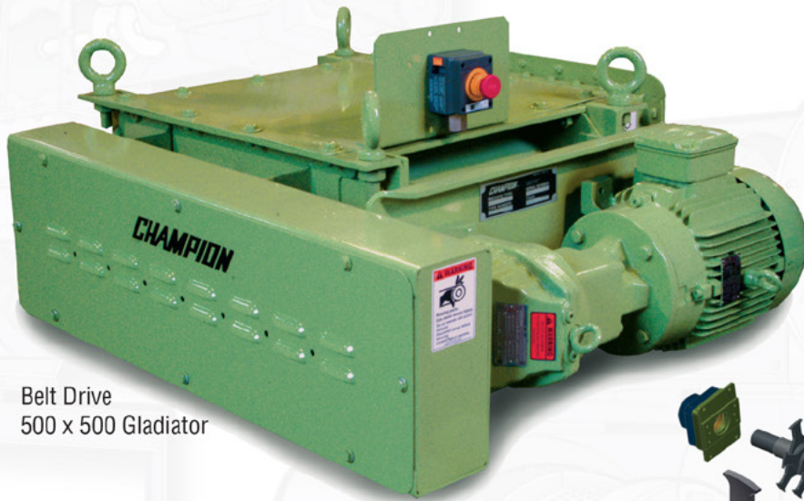
Belt Drive 500 x 500 Gladiator