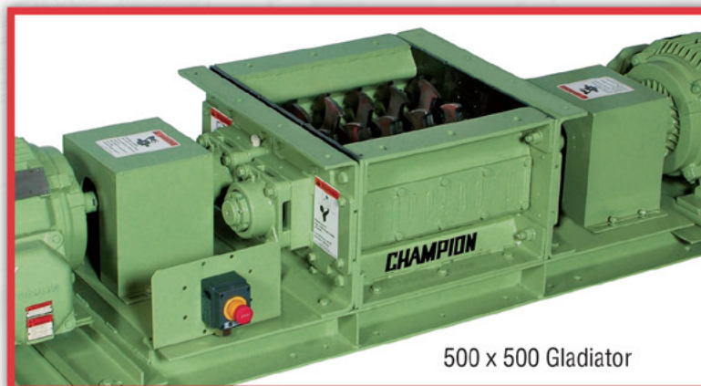
500 x 500 Gladiator

Available from 20 HP to 120 HP, the Gladiator is the reduction machine of choice for agglomeration applications. Available in either low or high speeds and carbon steel or stainless steel construction, the Gladiator has the features you need from the name you trust: CPM Roskamp Champion.